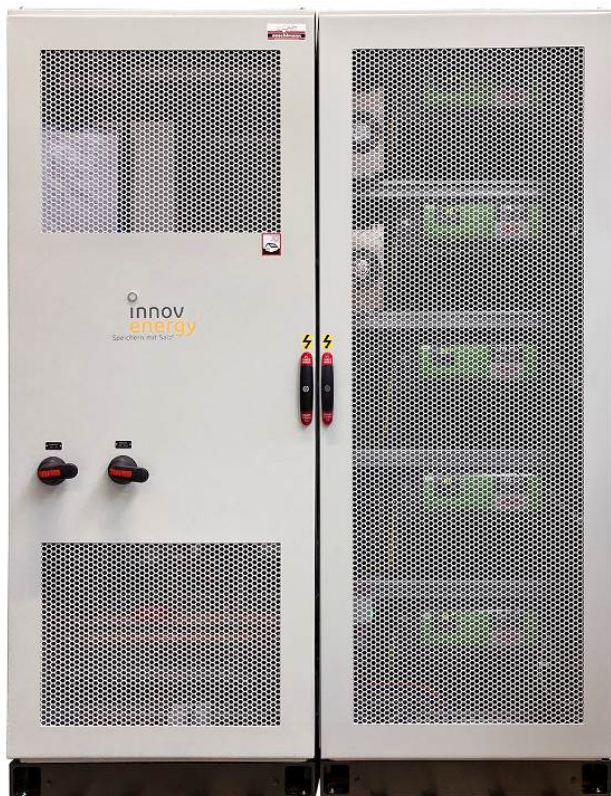
Fig. 4: Salt battery on sodium-nickel basis from innovenergy