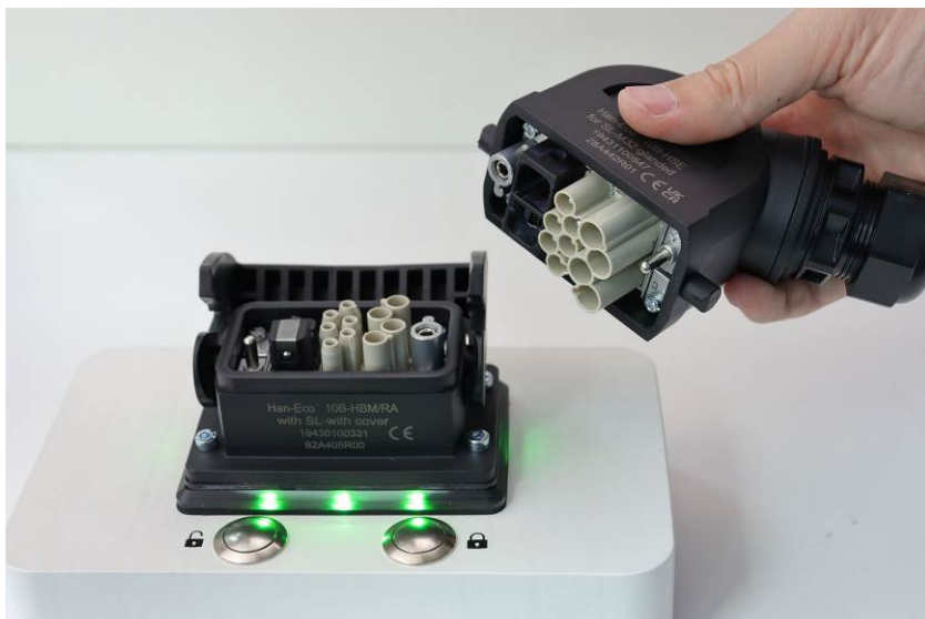
Fig. 5: Plug-in connector from Harting