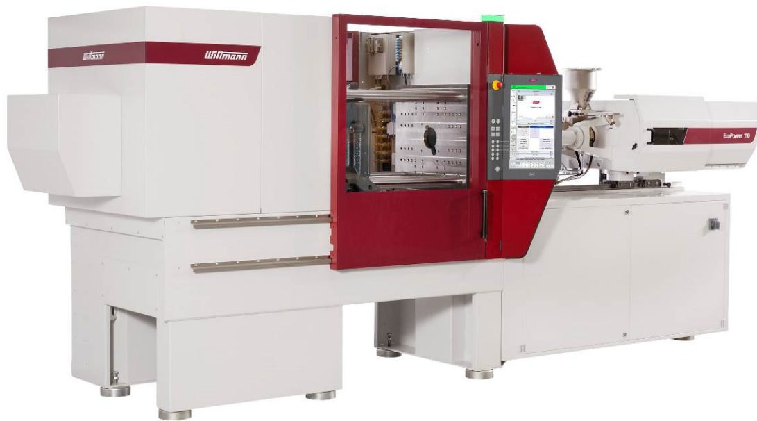
Fig. 6: Highly dynamic EcoPower B8X 110/525