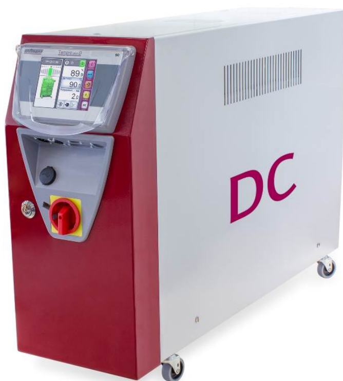
Fig 3: Tempro plus DC temperature controller capable of integration into a DC grid