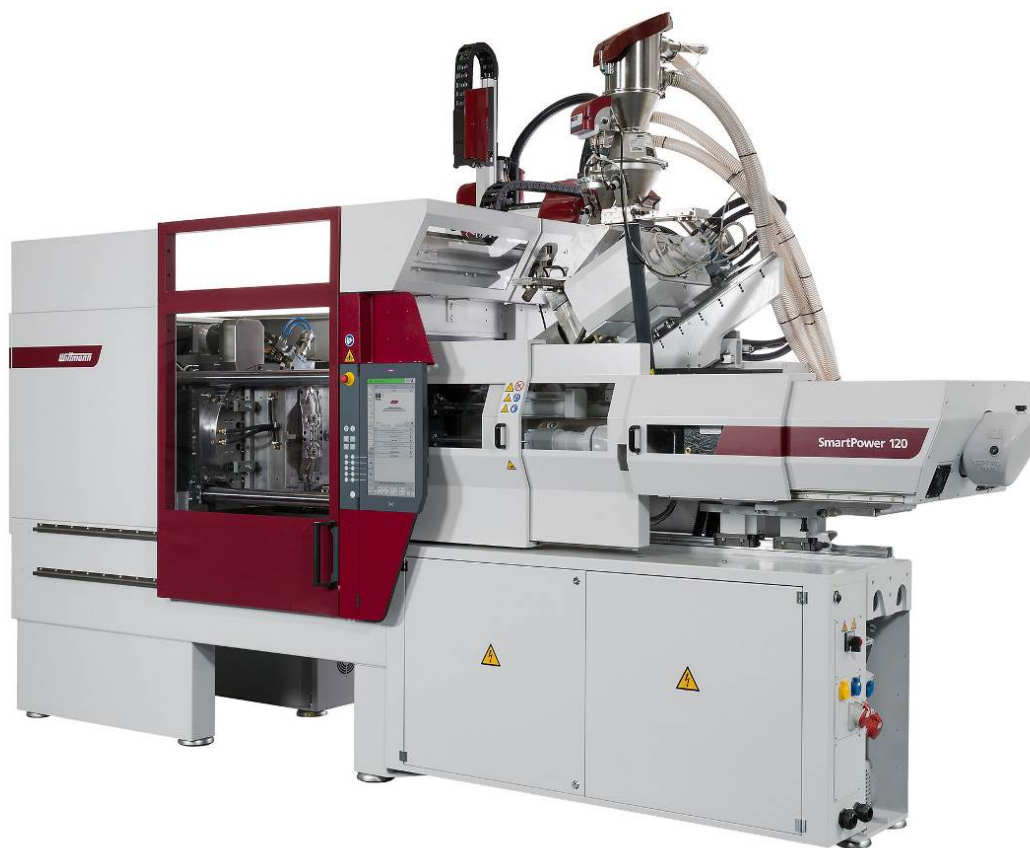
Fig. 1: SmartPower B8X 120/350H/130S with electric injection unit

This application will also serve to demonstrate a central conveyor system for liquid silicone. Here, a Nexus Servomix X200 dosing system will handle the central LSR supply. A Servomix X1 booster unit will transport the liquid silicone from the main supply line to the injection molding machine.