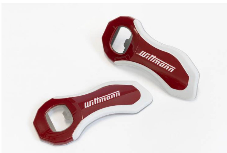
Fig. 2: Bottle openers made of PC and TPE