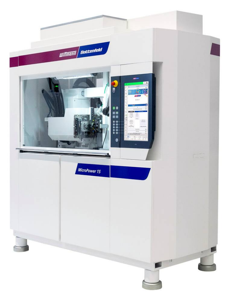
Fig. 1: MicroPower 15/10 MEDICAL