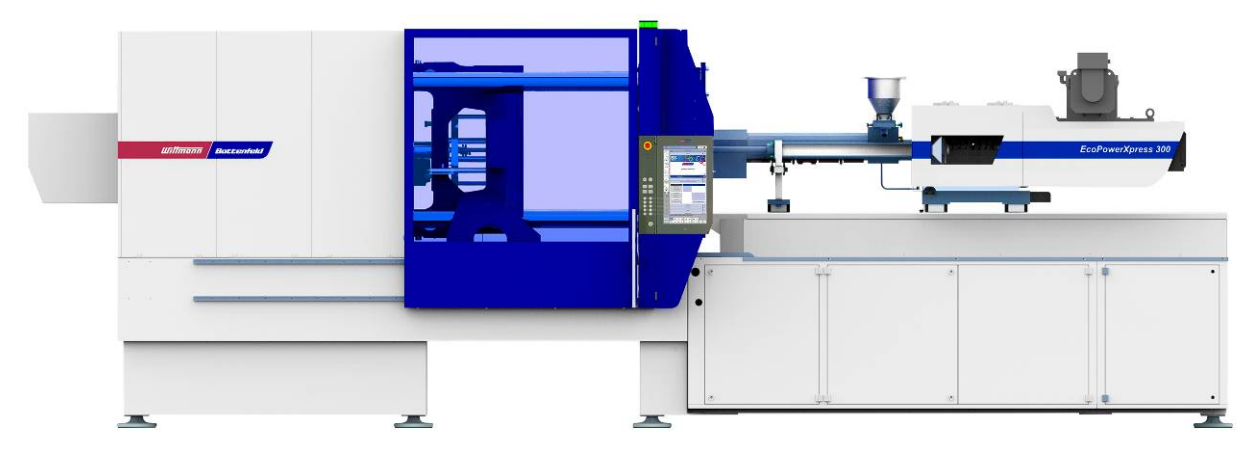
Fig. 3: EcoPower Xpress 300/1100+