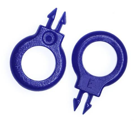
Fig. 2: Micro retaining ring for medical miniature tubes with a part weight of 2 mg