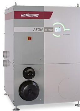
ATON H1000 battery dryer

WITTMANN has been successful for more than ten years in the field of material drying with its segmented wheel technology, a technology continuously refined over time in order to adjust it to changing needs and requirements on the market. While the original overriding goal was to achieve a constant dew point behavior even under the most difficult conditions, users very soon started to demand particularly energy-efficient solutions. To cater to the increasing trend towards production equipment integration, an interface solution was created for WITTMANN 4.0 , and the WITTMANN dryers were also equipped with larger touch screens. WITTMANN ATON segmented wheel dryers were laid out as compact beside-the-press appliances which could handle a dry air volume ranging from 30 to 120 m 3 /h.