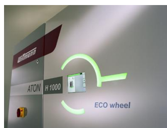
Front of the ATON H1000, close-up view

The experience gathered over the last ten years has now led to the development of a battery dryer model with a segmented wheel, which will be presented for the first time at this year's K. The ATON H1000 battery dryer, already frequency-controlled in the standard version, is the first segmented wheel dryer for central plants. It can handle a dry air volume of 1,000 m 3 /h, which is capable of drying 500 to 600 kg of plastic granulate per hour. The ECO wheel drying wheel, consisting of numerous segments, is loosely filled with a desiccant. Similar to the compact appliances, it is rotated via a low-maintenance chain drive. In this way, a molecular sieve which is always fresh is available for the air to be dried, in order to maintain a constant, low dew point.