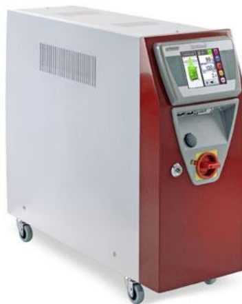
TEMPRO plus D100

Requirements analyses in a great variety of production sectors have pointed to a demand for pressurized temperature controllers for a maximum temperature of 100°C. To meet this demand, WITTMANN will introduce the new temperature controller model TEMPRO plus D100 at this year's K in Düsseldorf. With this appliance, WITTMANN underscores once more the significance of this series and its expertise in product development.