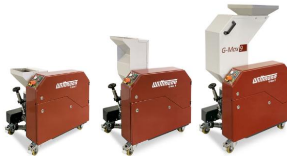
G-Max 9 granulator with low, medium-height and standard-height material hopper

Depending on the type of application, there are three material hoppers of different heights to choose from for the G-Max 9 . This modular design concept enables adjustment of the beside-the-press granulator to the varying process technology requirements it has to meet.