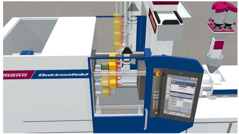
Visualization of the corresponding removal process.