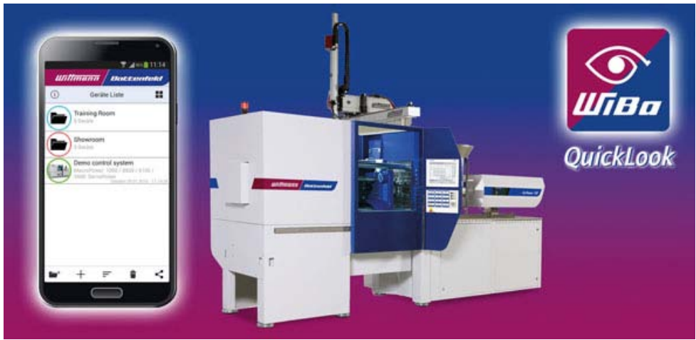
WiBa QuickLook app, now available free of charge from the Apple App Store or from Google Play.

The WiBa QuickLook app from WITTMANN BATTENFELD provides a very simple and comfortable way to check the status of injection molding machines and robots via Smartphone.