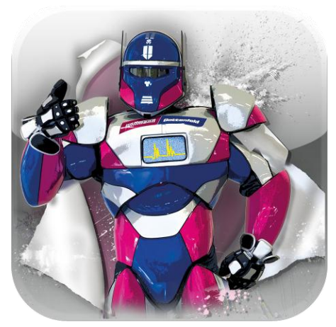
Fig. 1: WIBA Assist icon

"Wittmann Group K2013" is available free of charge for iPhones, iPads, Androidphones, Android tablets und Windows phones.