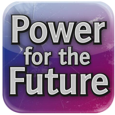
Fig. 3: Wittmann Group K2013 icon