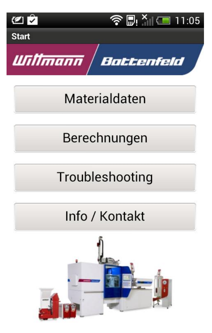
Fig. 2: WIBA Assist starting screen