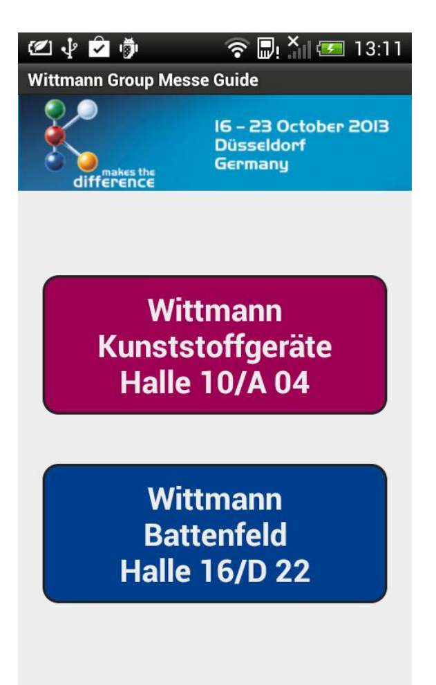
Fig. 4: Wittmann Group K2013 for phones