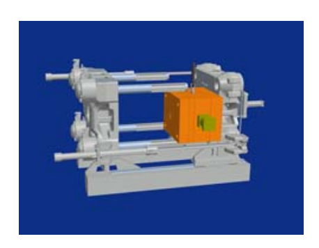
Fig. 3: mold insertion in the standard version