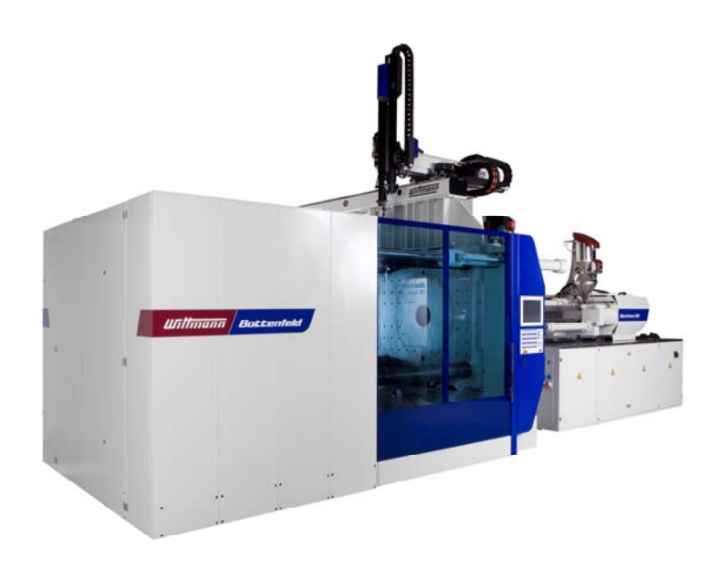
Fig. 1: the new MacroPower 650 - energy-optimized with servo drive